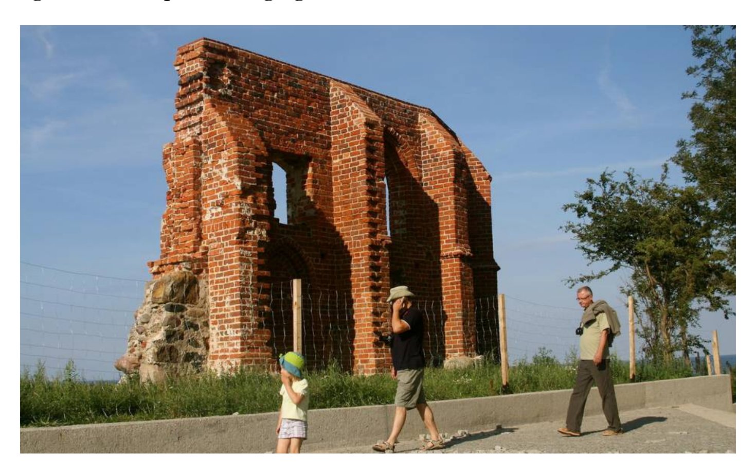
Tenth-century church ruins are the highlight of a trip to Trzesacz.

a 10th-century church built on the edge of a sandy cliff, most of its structure lost to erosion. In Niechorze, I climbed the 200 steps to the top of a red-brick lighthouse that provides a gorgeous overview of the coastline.