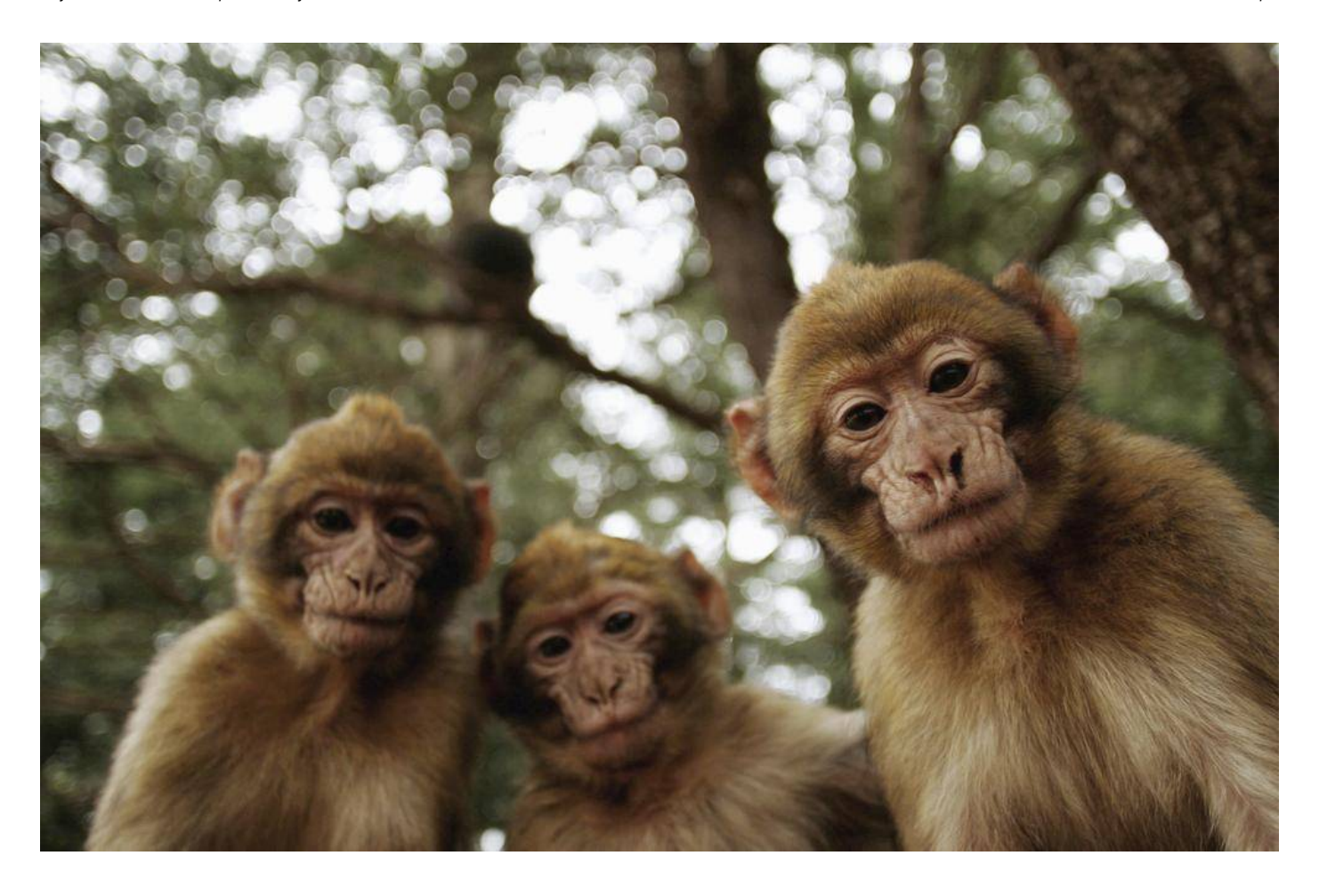
Barbary macaques look friendly, but be careful.

I never found my groove in Morocco. Long after the bites stopped itching I remained on edge – and the gaffes kept coming. In the main square of Meknes, I came within a centimetre of stepping on a semi-charmed cobra. In the Middle Atlas mountains, a Barbary macaque nearly took my hand off going after the peanuts I was attempting to feed her. I kept trying to map my routes through the labyrinthine medinas of Marrakesh and Fes but I kept getting lost, and I grew increasingly irritated by the touts who kept trying to get me lost in order to extract a "guidance" fee.