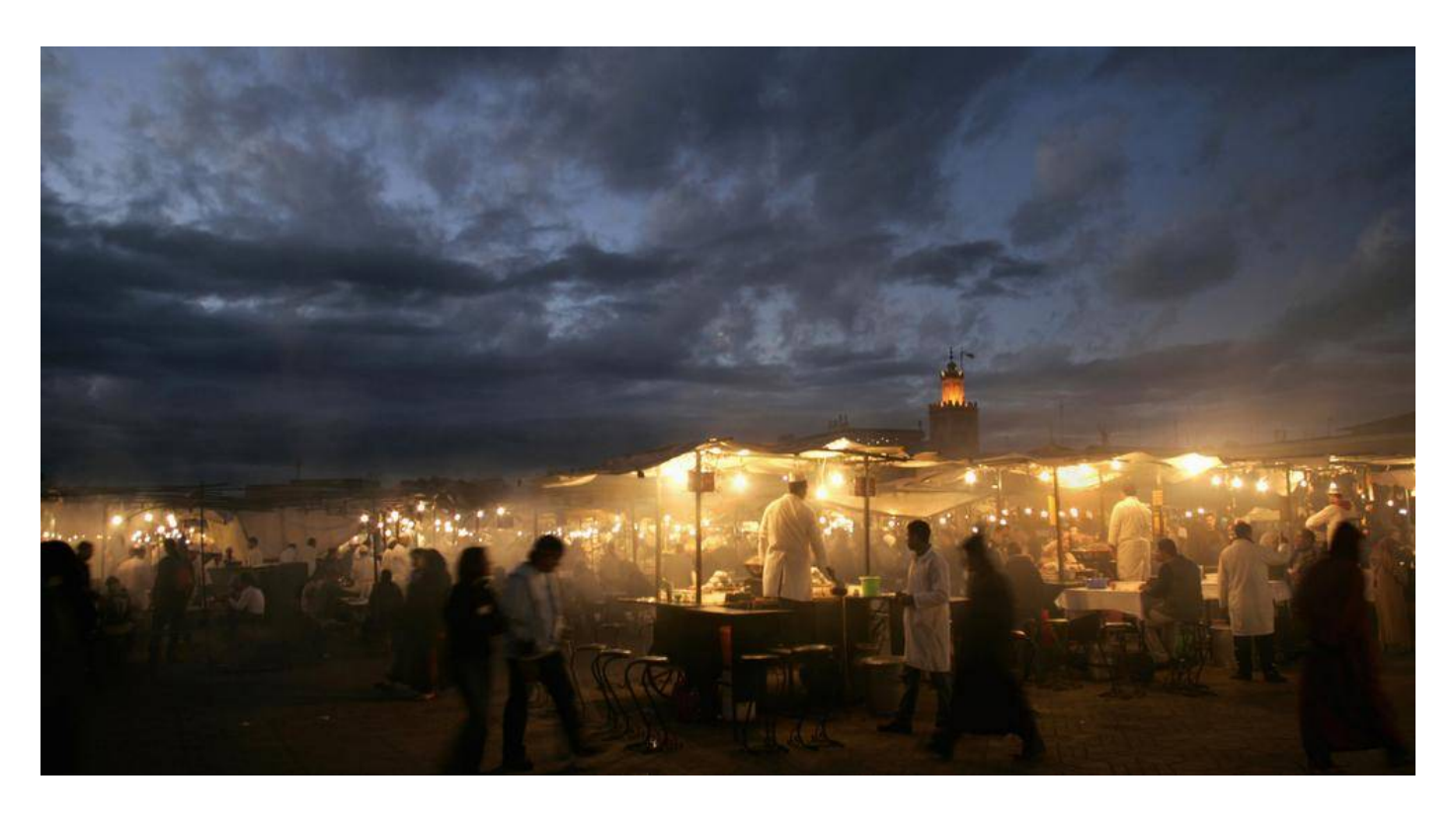
Marrakesh's Djamaa El Fnaa square.

My Moroccan expedition proceeded in two stages. First, I crossed the Atlantic on a 15-day repositioning cruise from Ft. Lauderdale to Barcelona. Then, on my 32nd birthday, I made the short hop to Casablanca and spent the next three weeks moving between Marrakesh, Rabat, Meknes, Fes and Tangier.