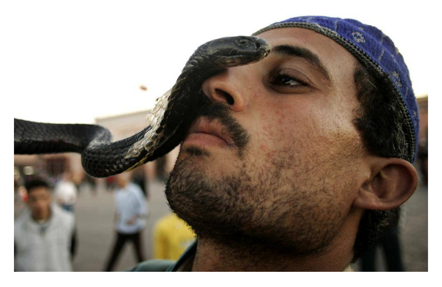
A snake charmer performs in Marrakesh's Djamaa El Fna square.

I scrambled to find the French vocabulary to properly excoriate my host, but to no avail. He was off in his own distant, presumably bedbug-free, residence. And so I spent my first night in Morocco – my birthday – sitting sleepless in a rock-hard chair in the riad's central courtyard.