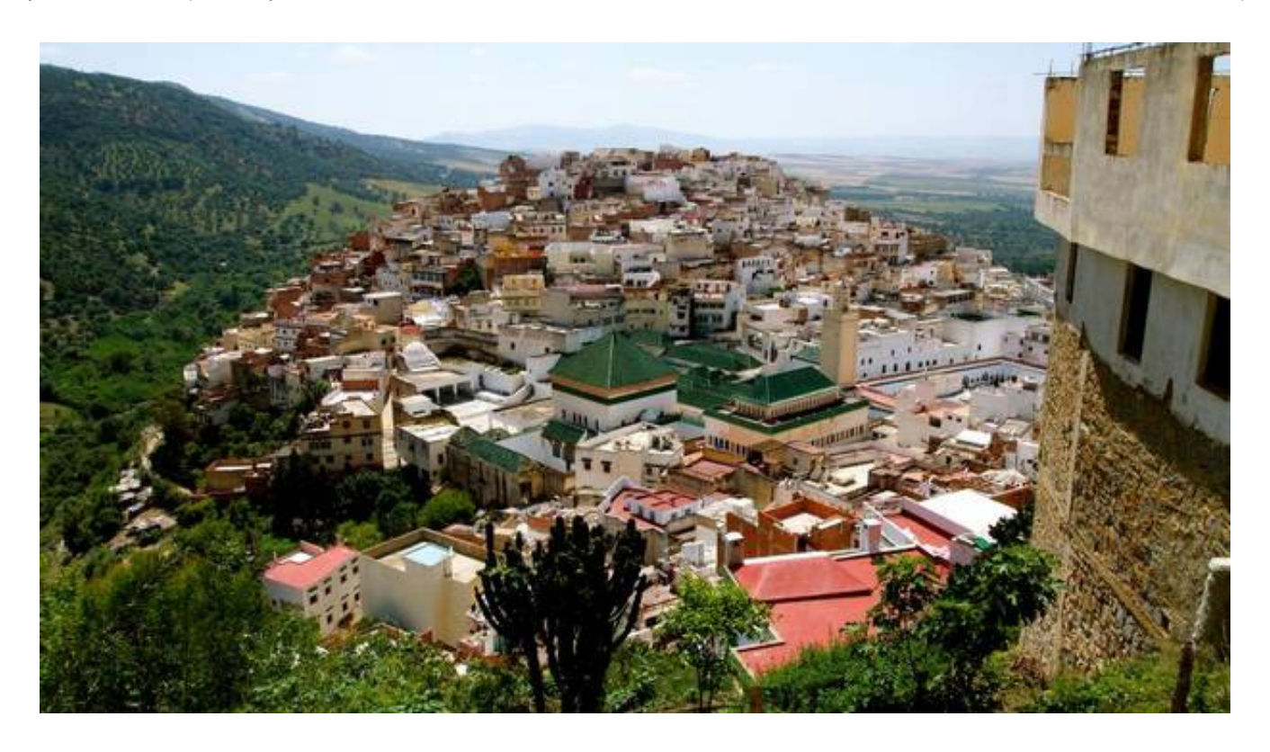
Moulay Idriss Zerhoun in the north of Morocco.

At the Marrakesh train station, I had my first go at the Moroccan sport of taxi-fare negotiation – an advanced-level activity at which, I quickly found, I do not excel. I was dropped at Jemaa el Fna, the vast, dusty central square. I made my way past snake charmers, storytellers and gloveless amateur boxers to meet the friendly Frenchman who owned my chosen accommodations: a riad – a large traditional house – that he operated as a B&B in the medina. After navigating the old town's tangled streets – I never could have managed them alone – we reached it, and it was lovely. I unpacked, took a shower, fell asleep – and woke up a few hours later covered in bedbugs.