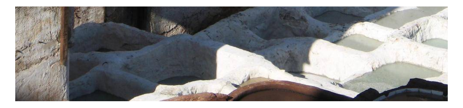
Fes, the oldest of Morocco's imperial cities.

I never sank that low, but I came close. By the end of my three weeks, I was utterly exhausted. In my past travels, I felt energized and propelled by adventure. Morocco taught me just how tame my sense of "adventure" had been. I met the genuine article, and it felt an awful lot like work.